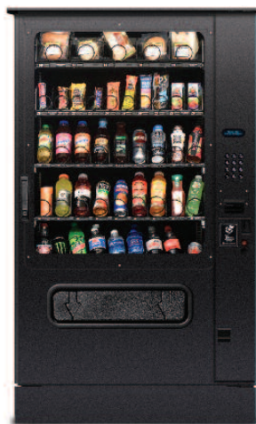
Shown with optional kick panel.