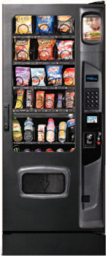
Shown in black door with kick panel option.