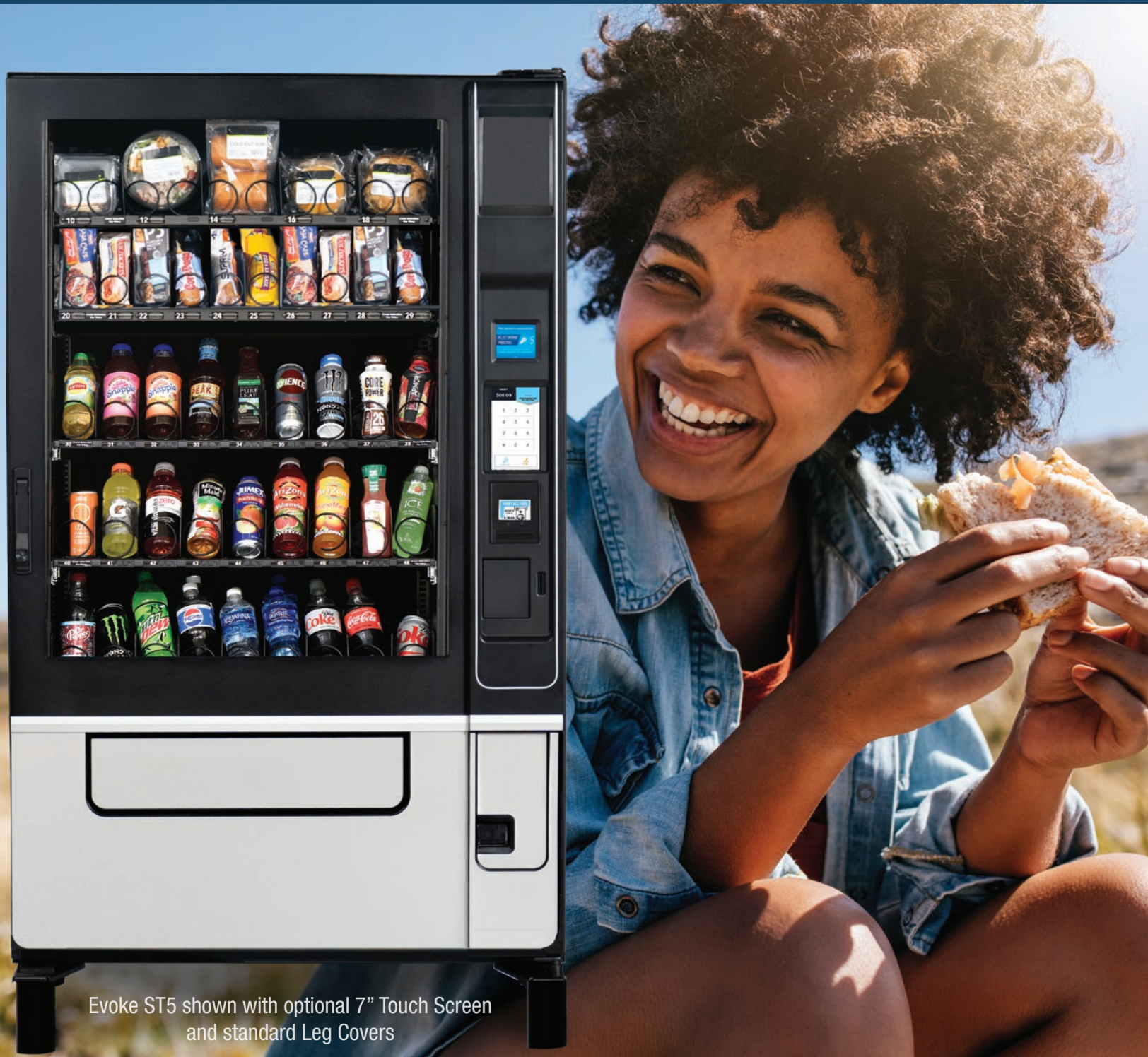
Evoke ST5 shown with optional 7" Touch Screen and standard Leg Covers

The refrigerated merchandiser designed for performance and built to last