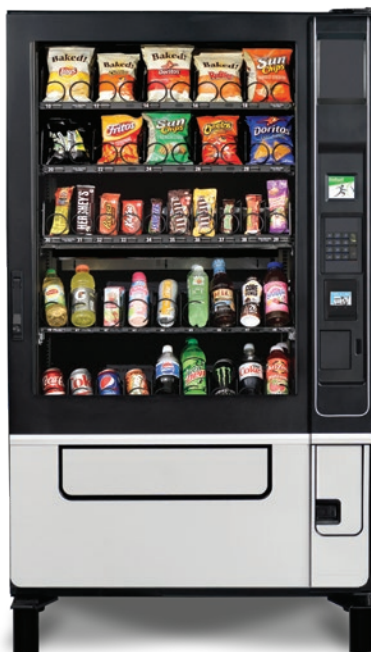
Evoke VT5 shown with standard 3.5" Display, Braille Identified Keypad and Leg Covers