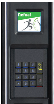
Braille Keypad Standard