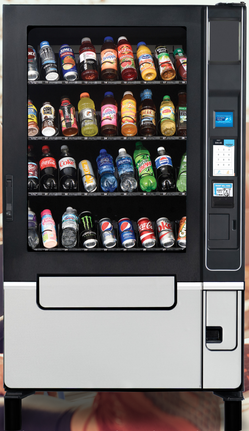
Shown with optional 7" Touch Screen and Standard Leg Covers

The refrigerated merchandiser designed for performance and built to last