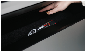
ADA Delivery Bin