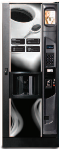
Shown with kick panel option.