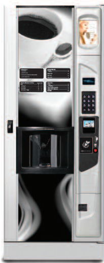
Shown with platinum door and kick panel options.

Available in freeze dried, fresh brew or bean-to-cup configurations, the Geneva dispenses a broad menu of premium and specialty coffees and serves them just the way your customers like them.