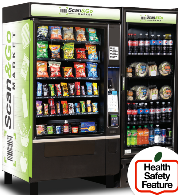
Shown with optional PUSH-IT Tray and standard Leg Covers

Stock a wide variety of in-demand, high-margin fresh food, beverages, and snacks in one affordable solution.