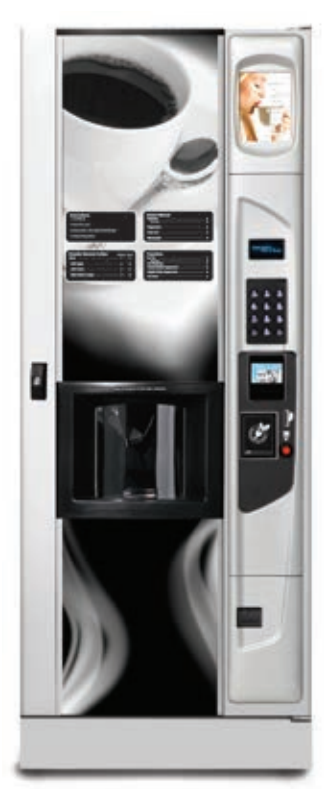
Shown with Platinum Silver door and Kick Panel option Available with Black door.