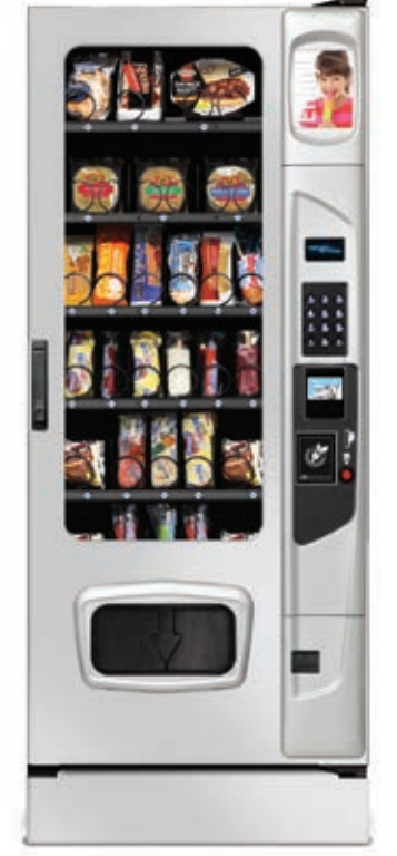
Shown with Platinum Silver door and Kick Panel option Available with Black door.

Shown with standard 3.5" Display, Braille Identified Keypad and Leg Covers