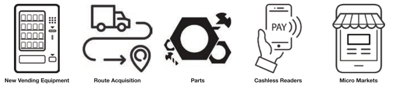
Leasing options also available

Innovative Finance Solutions Available For: