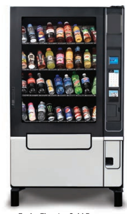
Evoke Elevator Cold Beverage Shown with optional 7" Touch Screen and standard Leg Covers