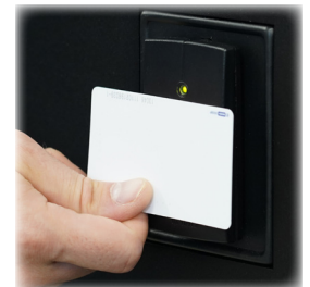
Proximity Card Reader