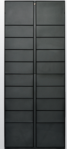
IntegrityGuard Satellite Adjustable Smart Locker