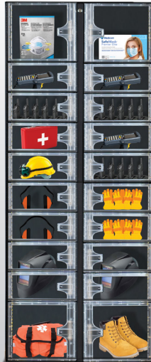
ClearVision Satellite Adjustable Smart Locker