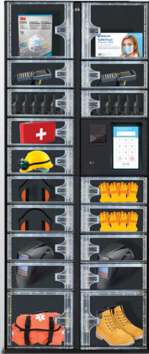
ClearVision Stand Alone Adjustable Smart Locker