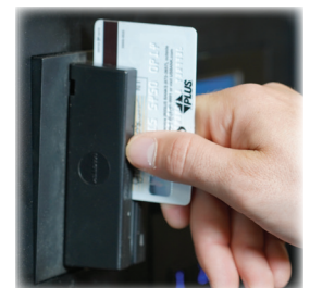
Mag Stripe Reader