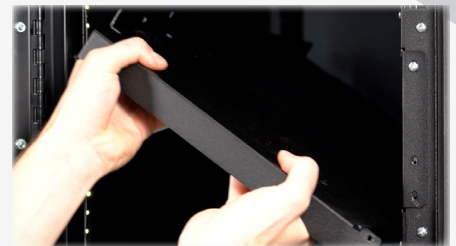
Easily Adjust Compartment Sizes

With iQ Technology you have real-time data of who took what, where it was used, and when it was returned. Reduce inventory hoarding, overuse and shrinkage, while analyzing usage to maximize inventory availability.