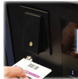
Barcode ID Scanner

Employees can access locker items using a variety of access methods including: RFID badge, magnetic stripe, proximity card reader, barcode, personal PIN, biometrics, credit card reader (retail applications) and more.